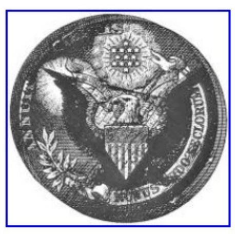
The three stars around the Masonic eye the eagle's shield is positioned in the corner of The eye has come down on the represent the trinity the pyramid the tip of his wing ends precisely pyramid (New World Order at the end of the illumined light. This shows a very careful design.